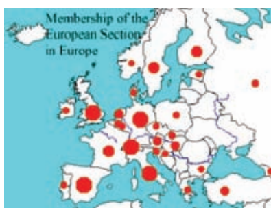
Membership distribution of all European Section members in Europe.